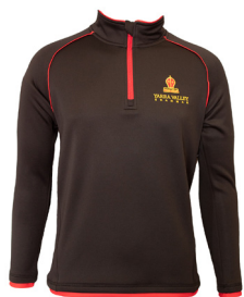
QTR zip Top