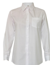
Blouse Yrs 3 - 6