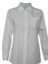
Blouse Peter Pan Prep - 2