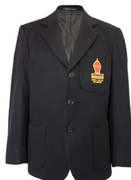
Blazer Unisex Yr 3-6