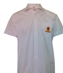
Short Sleeve Shirt