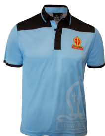
House Polo Annells