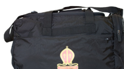
Senior Sports Bag