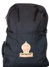
Chiropak Yrs 3-6