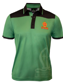
House Polo Plummer