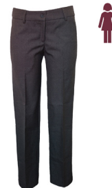
Tailored Pants Grey Melange