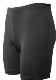
Bathers Boys Jammers