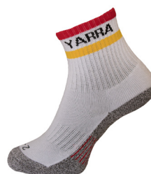
Sports Sock 2 pkt