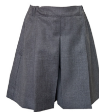
Skort Prep - 2