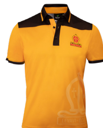
House Polo Hughes