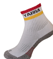
Sport Socks 2pkt