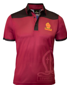
House Polo Arnott