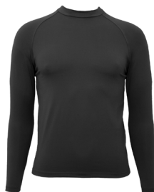
Rashi Bathers Top