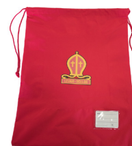
Swim / Library Bag