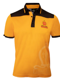
House Polo Hughes