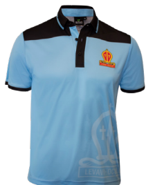
House Polo Annells