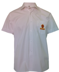
Short Sleeve Shirt