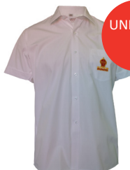
Short Sleeve Shirt