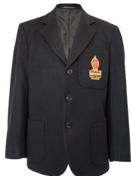
Blazer Unisex Yr 3-6