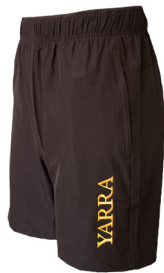
Sport Short Unisex