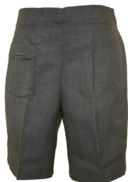
Shorts Pull on Prep to 2 Mid Grey