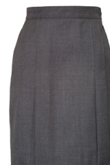
Skirt Yrs 3 - 6