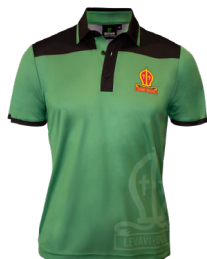
House Polo Plummer