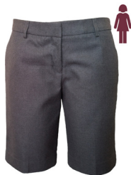
Shorts Tailored Dark Grey