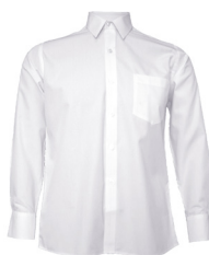
Long Sleeve Shirt