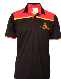
Interschool Sports Polo Compulsory Yr 4-6 / Yr 3 if selected