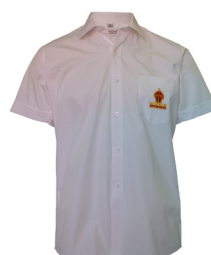
Short Sleeve Shirt