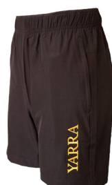
Sport Short Unisex