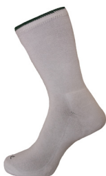
Socks white with stripe