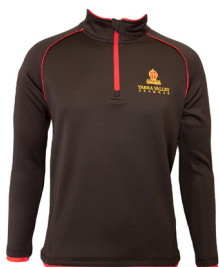
QTR Zip Top