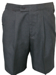
Shorts Senior Grey Melange