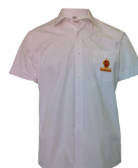
Short Sleeve Shirt