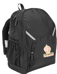
Unopak Prep - 3