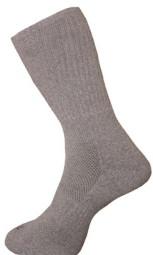
Socks grey marle 2pkt