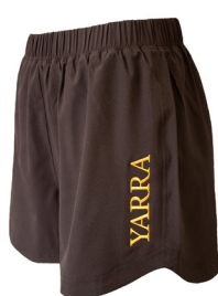
Sport Short Girls