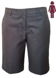
Shorts Tailored Dark Grey