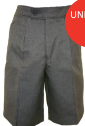
Shorts Fly Front Yr 3-6 Grey Melange